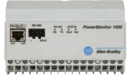
PowerMonitor 1000 BC3

Energy management and understanding energy costs are a major focus today in the industrial market. The Allen-Bradley® Bulletin 1408 PowerMonitor 1000 is a cost-effective energy monitor that is ideal for your applications where load profiling, cost allocation, or energy optimization is required. It also provides seamless integration to optimize your existing energy monitoring systems where sub-metering is required. The PowerMonitor 1000 is available in three models with features and a price point to meet your application.